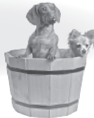
Boarding & Day Care

Now you can offer your clients extended payments for unexpected emergency procedures, preventative medicine and boarding and day care expenses with no credit application.