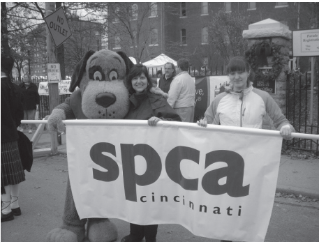
Above: SPCA Mascot Hero and friends at the Reindog Parade.